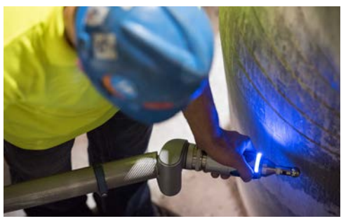
MIRON LASER ALIGNMENT WITH ARM

The laser equipment measures 3D coordinates by tracking a laser beam to a retroreflective target with the object of interest. This technology offers the following: